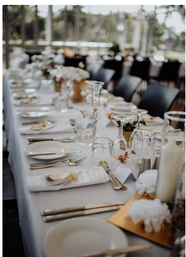
Outdoor Terrace Area