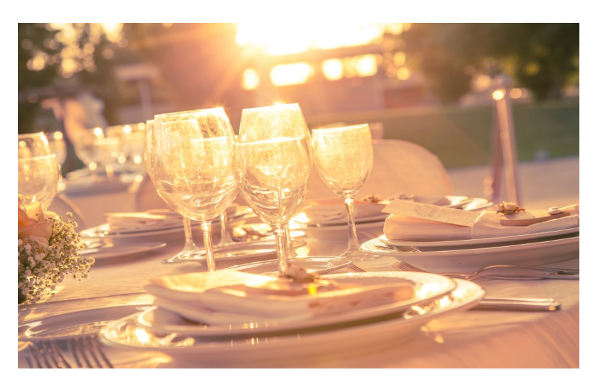
Minimum 50 Guests Prices are Subject to Change

Three Course Plated Menu Your Wedding Cake Cut and served on Platters Four Hour Beverage Package Wedding Specialist to Co-ordinate your Special Day Dressed Guest Tables with White Linen Fairy Light Bridal Background Chair Covers with Choice of Coloured Sash Selection of Centrepieces Bridal Table Skirted in White Dressed Cake Table & Present Table 5 Hour DJ Package Lectern & Microphone for Speeches Personalised Welcome Board 5 Hour Venue Hire